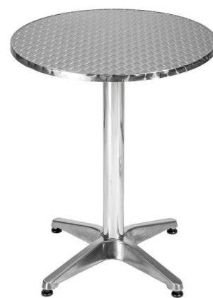
Table 2- Stand table in aluminum